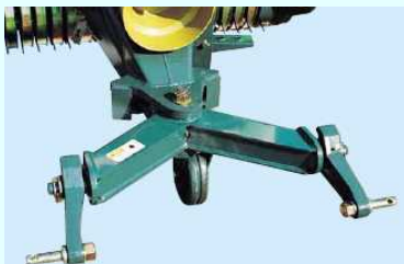
2P swivel hitch connection

With 2P swivel hitch traction, high mobility can be expected even in corner operation.