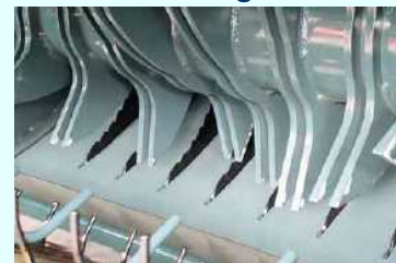
Standard cutting device

8 cutting knives cut material in pieces, the bale can be broken up easily for feeding even high density.