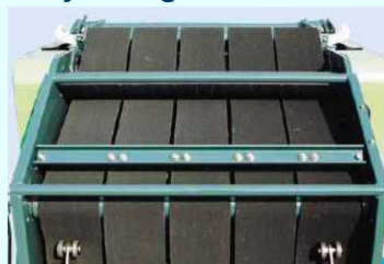
Speedy baling with rubber belts

5 rubber belts enable baling with high density (for silage and dried hay) or low density (for wet hay).