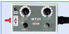
Simple switch box

Bale diameter can be set to 10 different levels with the switch box